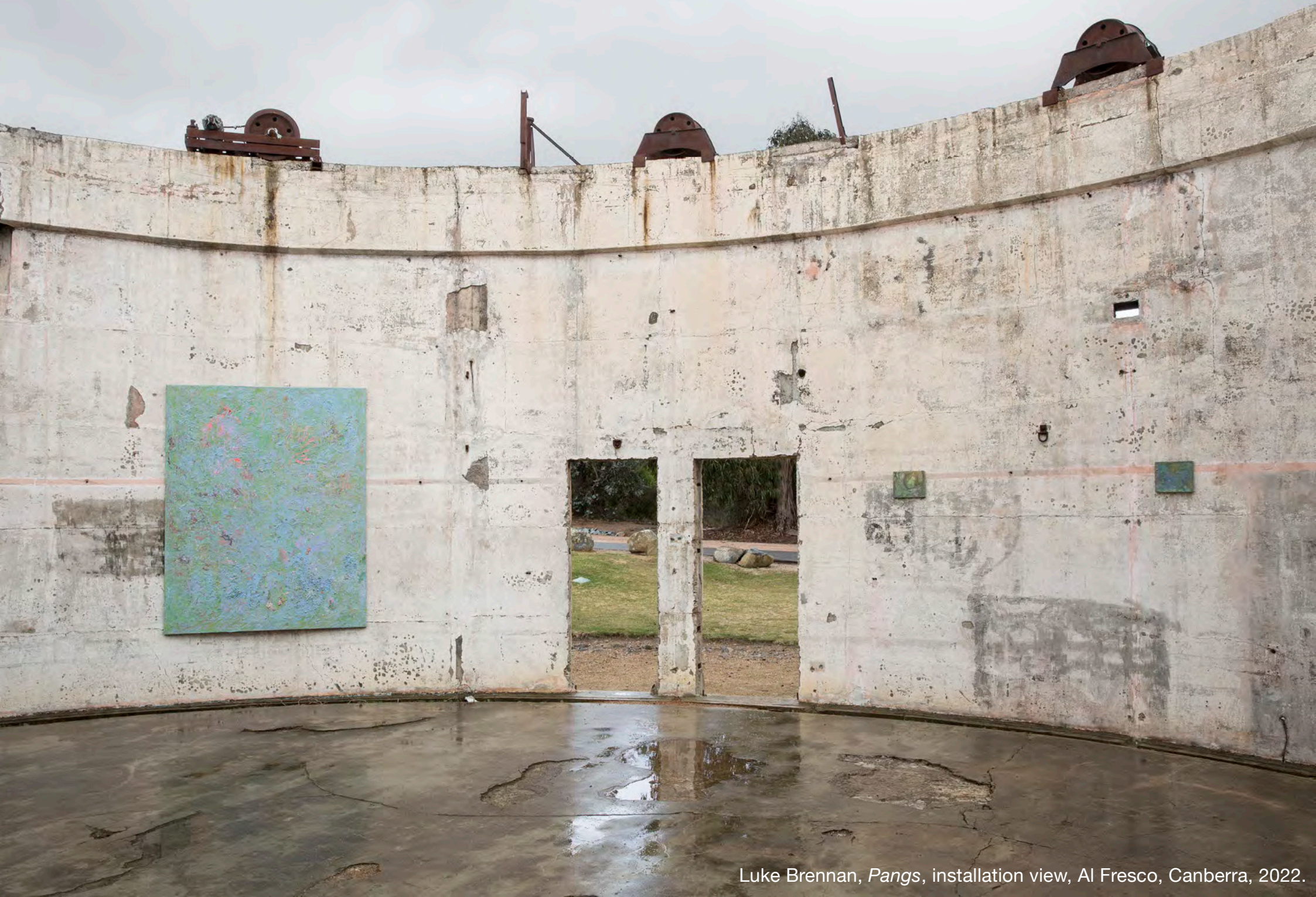
Luke Brennan, Pangs , installation view, Al Fresco, Canberra, 2022.