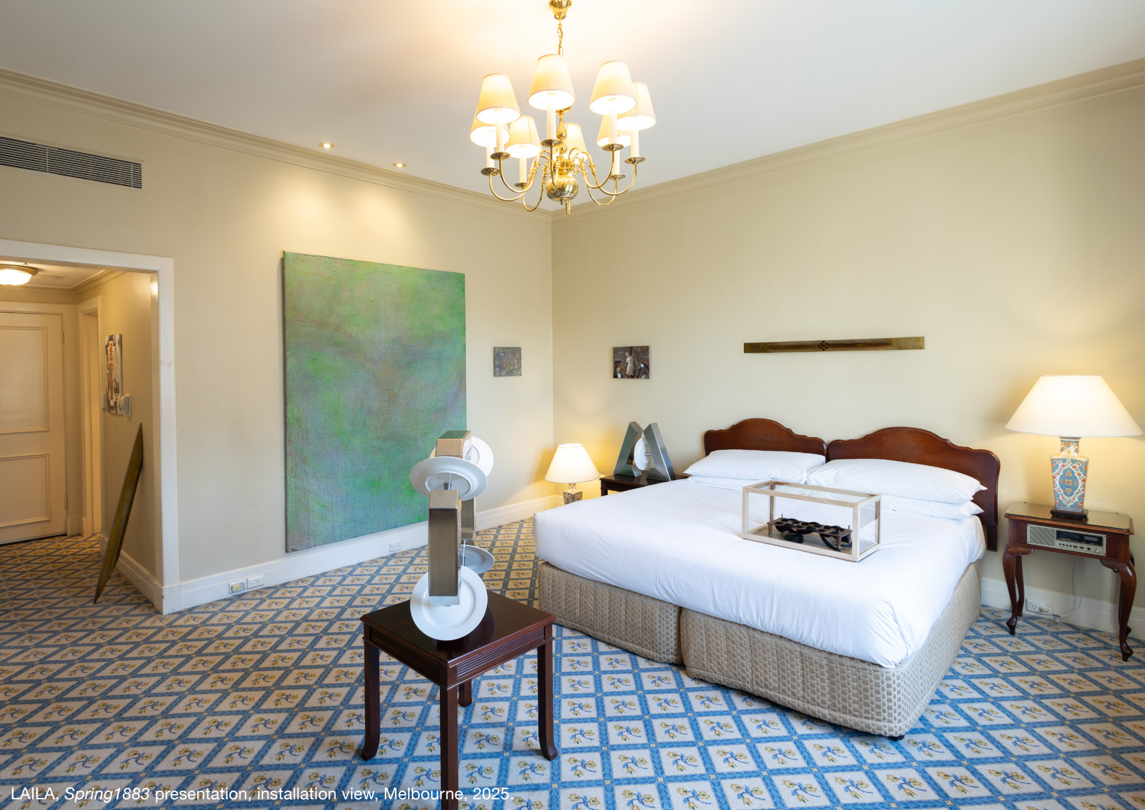
LAILA, Spring1883 presentation, installation view, Melbourne, 2025.