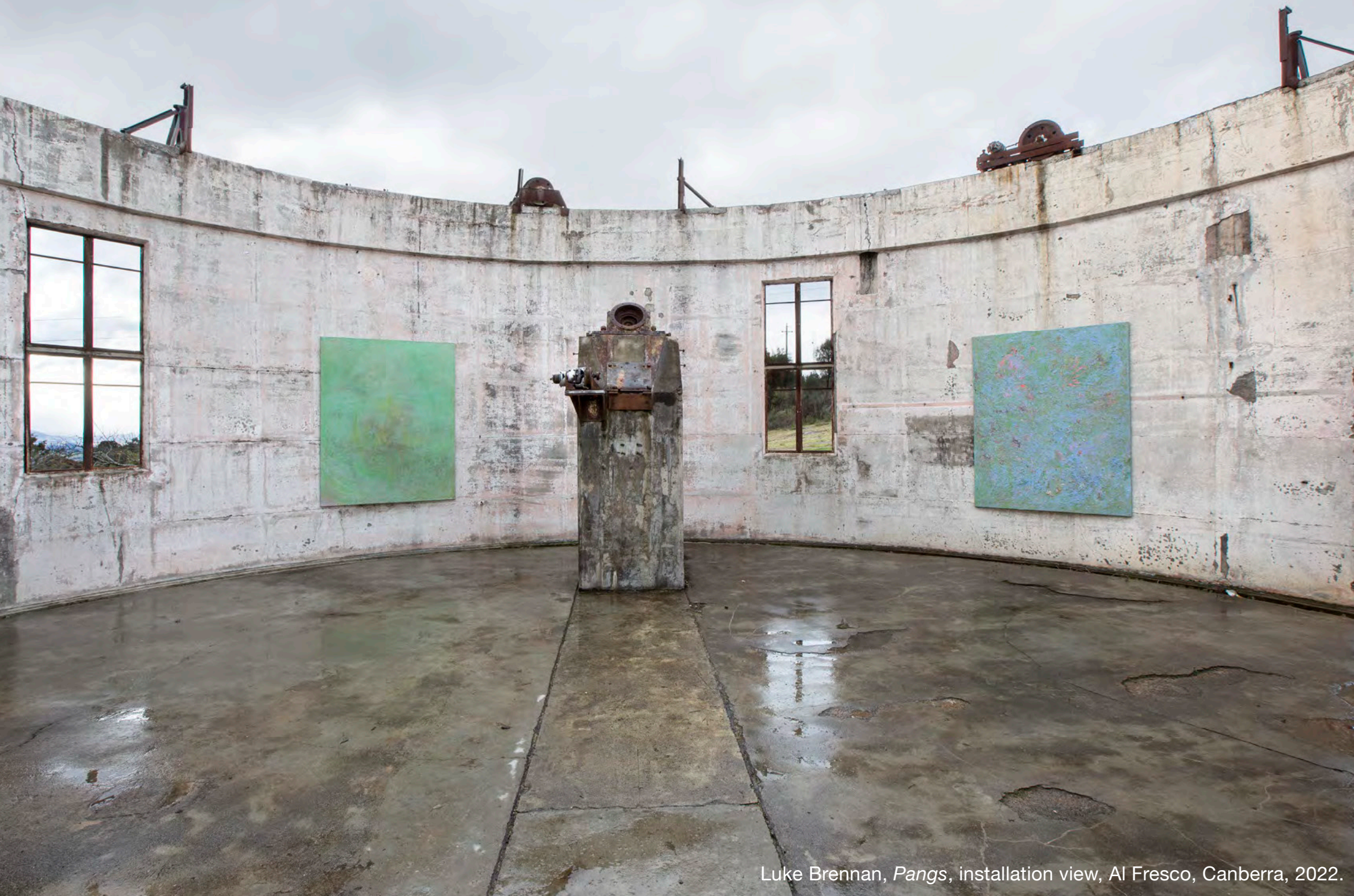
Luke Brennan, Pangs , installation view, Al Fresco, Canberra, 2022.