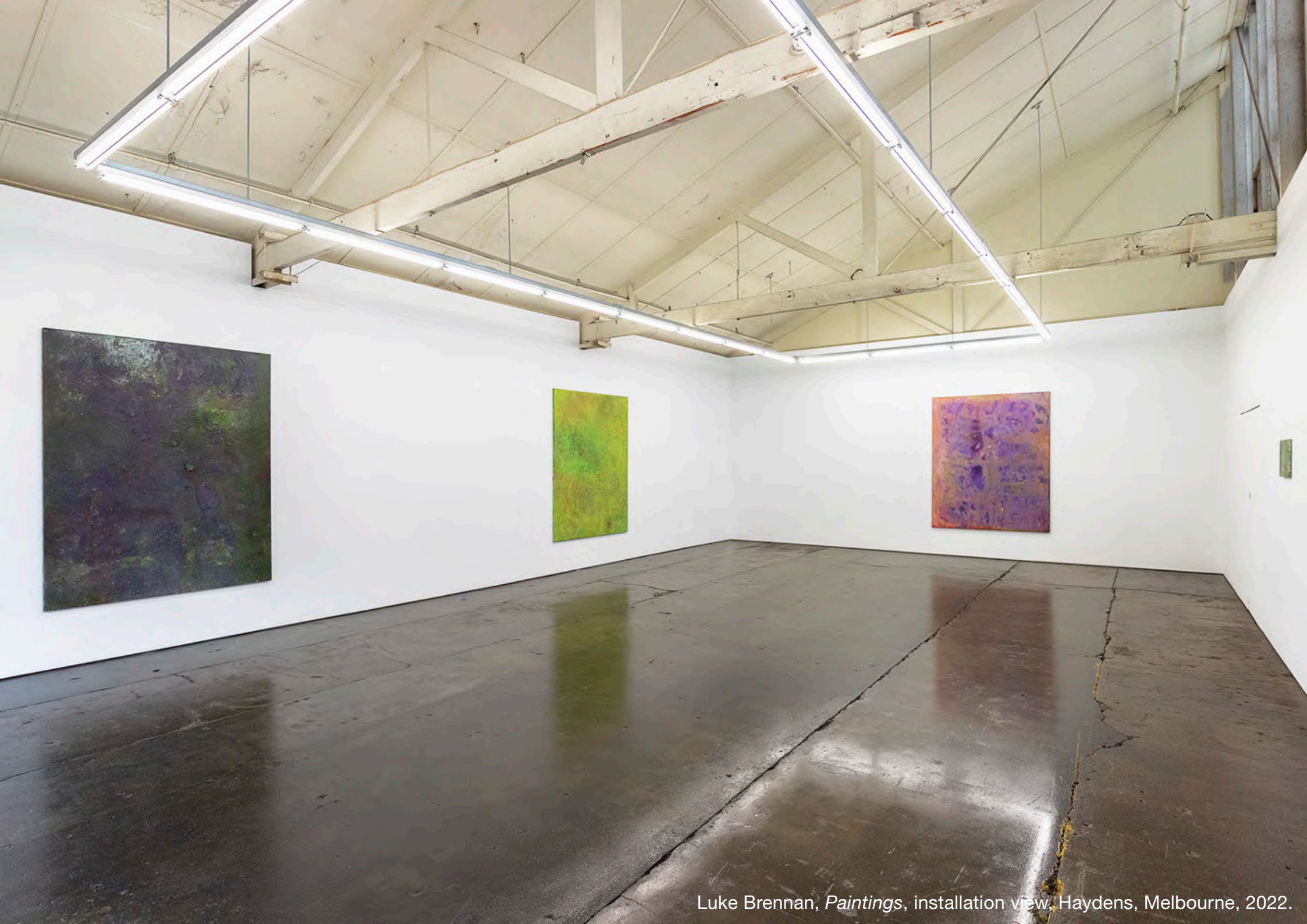
Luke Brennan, Paintings , installation view, Haydens, Melbourne, 2022.