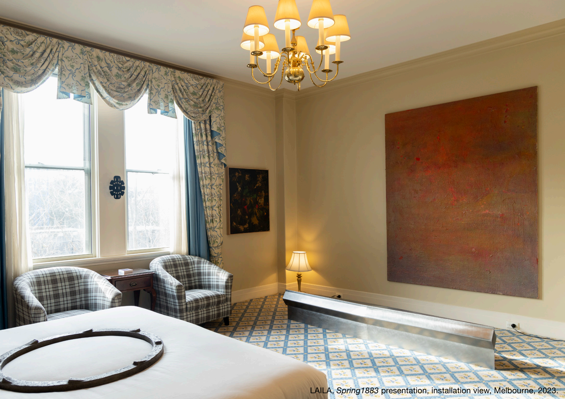
LAILA, Spring1883 presentation, installation view, Melbourne, 2023.