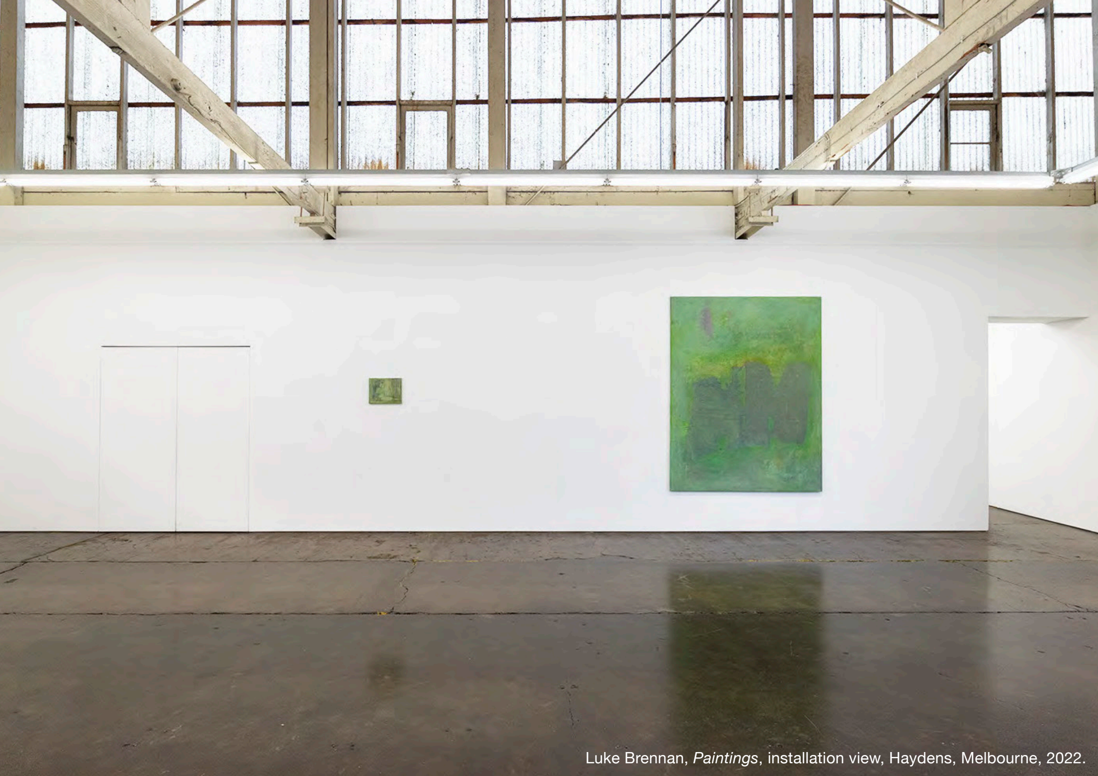
Luke Brennan, Paintings , installation view, Haydens, Melbourne, 2022.