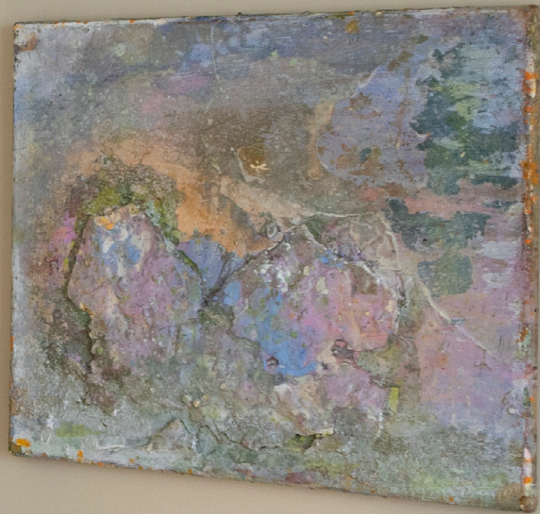
LAILA, Spring1883 presentation, installation view, Melbourne, 2023.