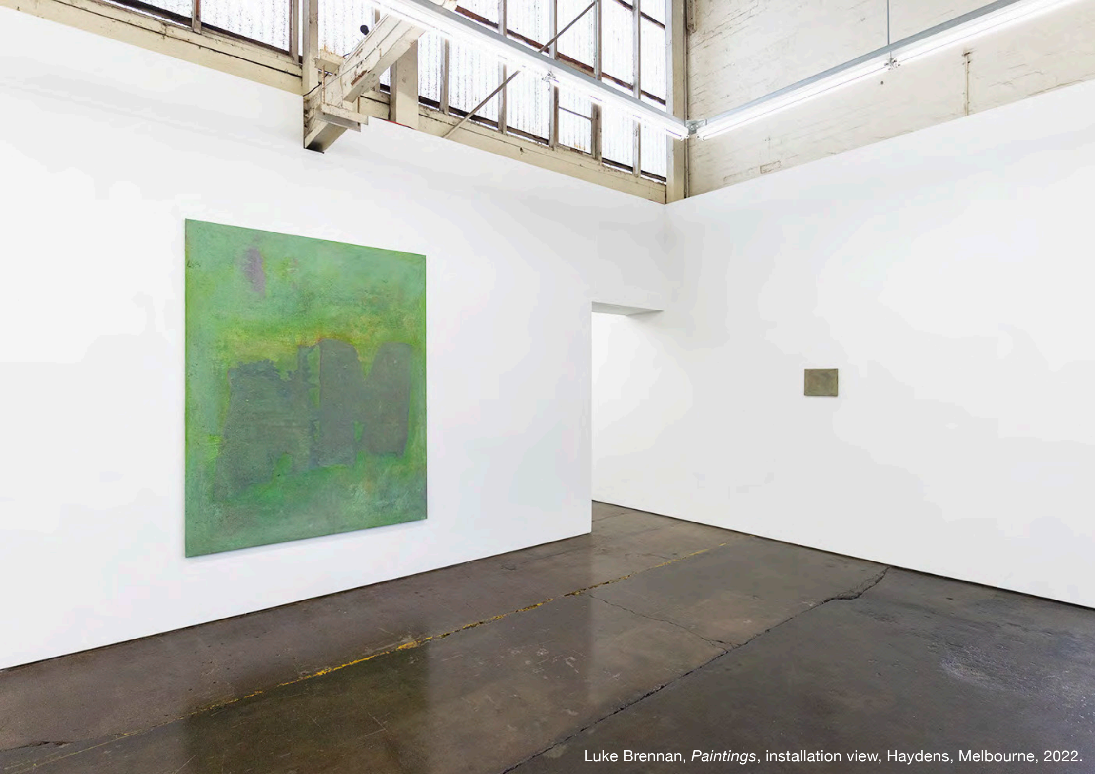
Luke Brennan, Paintings , installation view, Haydens, Melbourne, 2022.