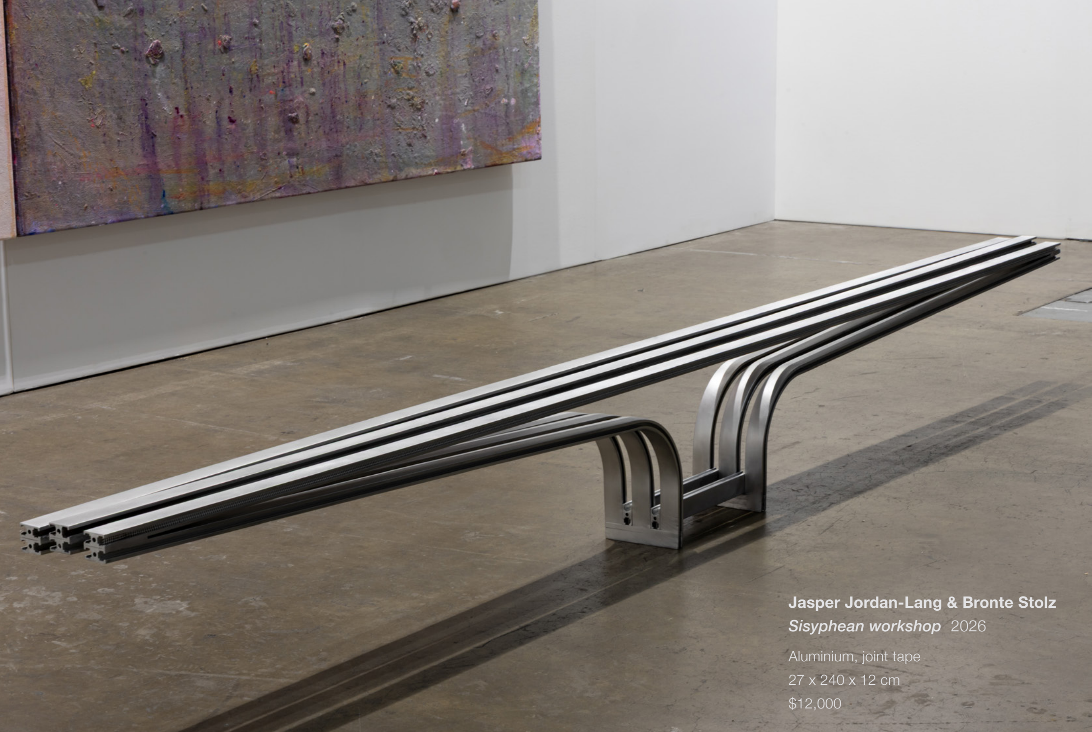
Jasper Jordan-Lang & Bronte Stolz Sisyphian workshop 2026

Aluminium, joint tape 27 x 240 x 12 cm $12,000